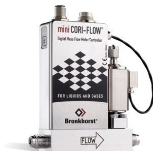
MINI CORI-FLOW™ M13V14I

Durchfluss 0...200 g/h Druckstufe 100 bar Medienunabhängig Hohe Genauigkeit, schnelle Messung