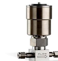
SERIES C2I, C5I

Durchfluss 0...300 kg/h Druckstufe 100 bar Medienunabhängig Hohe Genauigkeit, schnelle Messung