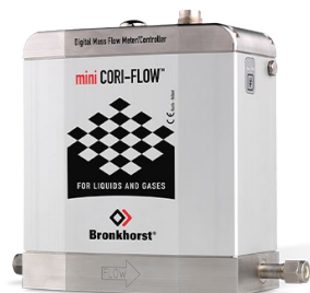
MINI CORI-FLOW™ M15

Durchfluss 0...2000 g/h Druckstufe 100 bar Medienunabhängig Hohe Genauigkeit, schnelle Messung