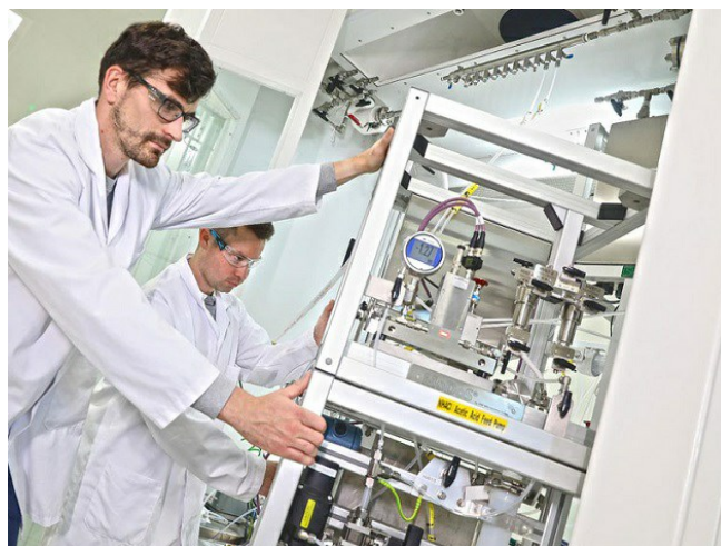
Liquid Dosing skid with CORI-FLOW

Traditionally, most human pharmaceuticals are manufactured in a step by step batch process to ensure consistent quality and efficacy of the finished medicine. More and more manufacturers switch from the traditional batch manufacturing process to a continuous manufacturing process.