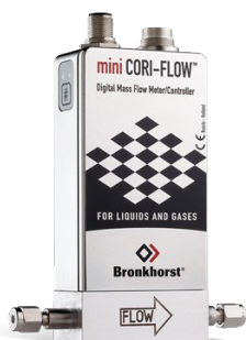
MINI CORI-FLOW™ M12

Durchfluss 0...200 g/h (0...2666 mln/min N 2 ) Druckstufe 200 bar Medienunabhängig Hohe Genauigkeit, schnelle Messung