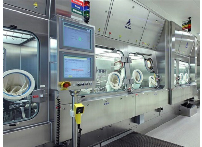
Isolator of SKAN AG, global player in the field of cleanrooms and isolators for the pharmaceutical industry

The Swiss based company SKAN AG , a global player in the field of cleanrooms and isolators for the pharmaceutical industry, asked Bronkhorst to help them with calibrating the air flow of the different microbial air sampler types that are required from the process owner.