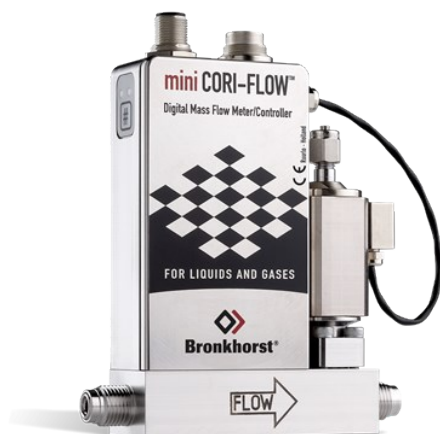
MINI CORI-FLOW™ M13V14I

Min. Bereich 0,1...5 g/h Max. Bereich 2...200 g/h Druckstufe 100 bar Medienunabhängig Hohe Genauigkeit, schnelle Messung