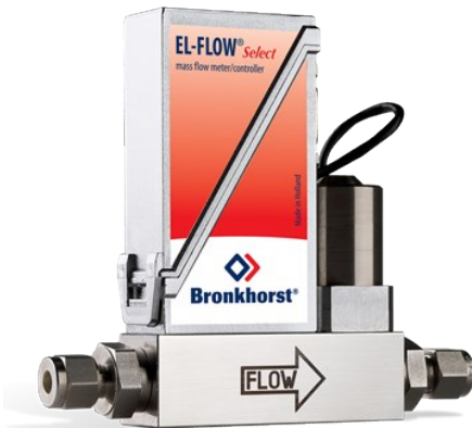
EL-FLOW SELECT F-201CV

Min. Bereich 0,16...8 mln/min Max. Bereich 0,5...25 ln/min Druckstufe 64 bar Kompakte Bauweise Hohe Genauigkeit & Wiederholgenauigkeit