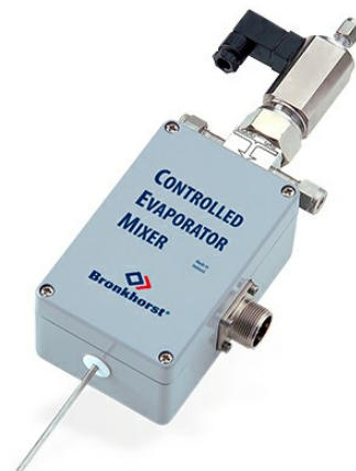
CEM EVAPORATOR W-102A

Min. Bereich 0,1...5 g/h Max. Bereich 2...200 g/h Druckstufe 200 bar Medienunabhängig Hohe Genauigkeit, schnelle Messung