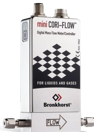
MINI CORI-FLOW™ M12

Min. Bereich 0,16...8 mln/min Max. Bereich 0,5...25 l/min Druckstufe 64 bar Kompakte Bauweise Hohe Genauigkeit & Wiederholgenauigkeit