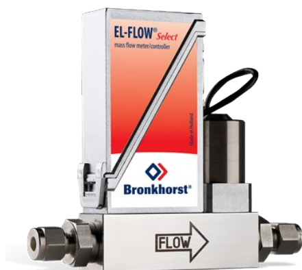
EL-FLOW SELECT F-201CV

Min. Bereich 0,16...8 mln/min Max. Bereich 0,5...25 l/min Druckstufe 64 bar Kompakte Bauweise Hohe Genauigkeit & Wiederholgenauigkeit