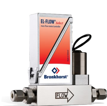
EL-FLOW SELECT F-200CV

Min. Bereich 0,014...0,7 mln/min Max. Bereich 0,18...9 mln/min Druckstufe 64 bar Kompakte Bauweise Hohe Genauigkeit & Wiederholgenauigkeit