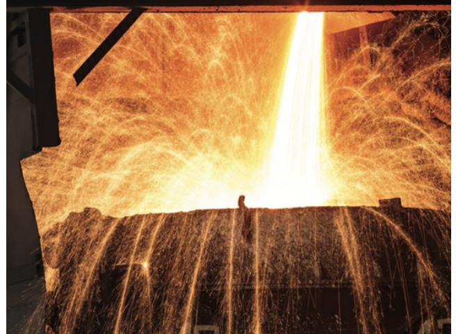
Iron and steel production

In the basic process pure oxygen is blown from above into the pig iron bath at a certain location using a water-cooled lance. It is important to keep the pig iron melt agitated, for a homogeneous reaction between the blown-in oxygen and carbon from the melt. Inert gases as nitrogen and argon are blown into the melt at the bottom of the converter in which the basic oxygen steelmaking process takes place, to get a well-agitated melt. Especially argon is an expensive gas. As a process dependent control of the gas is important, a company involved in manufacturing of special equipment for the steel industry requested the help of Bronkhorst.