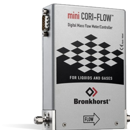
MINI CORI-FLOW™ ML120V00

Min. Bereich 1...50 g/h Max. Bereich 20...2000 g/h Druckstufe 100 bar Medienunabhängig Hohe Genauigkeit, schnelle Messung