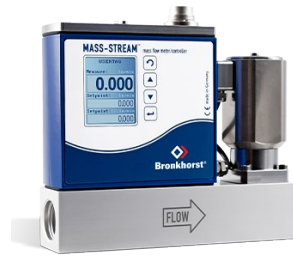
MASS-STREAM D-6361/002BI MFC

Min. Bereich 0,14...7 In/min Max. Bereich 1...50 In/min Druckstufe bis zu 20 bar Robuster Sensor, IP65 Gehäuse Option: integriertes TFT- Display