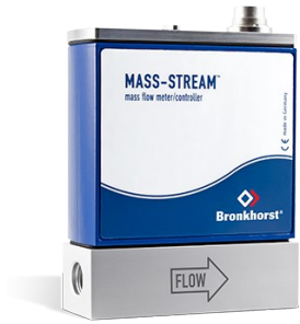
MASS-STREAM D-6341 MFC

Min. Bereich 0,14...7 In/min Max. Bereich 1...50 In/min Druckstufe bis zu 20 bar Robuster Sensor, IP65 Gehäuse Option: integriertes TFT- Display