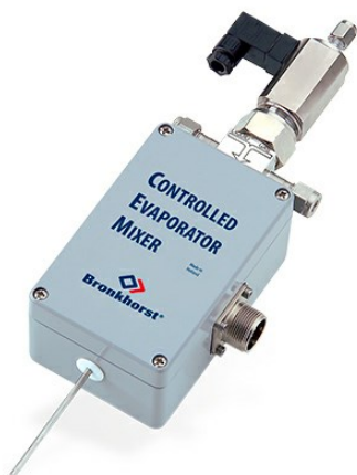
CEM EVAPORATOR W-102A

Max. 30 g/h Flüssigkeit; Max. 4 l/min Gas Druckstufe 100 bar Sehr stabiler Dampf-Durchfluss Flexibles Gas/Flüssigkeits Verhältnis