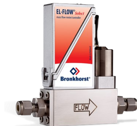
EL-FLOW SELECT F-201AV

Max. 30 g/h Flüssigkeit; Max. 4 l/min Gas Druckstufe 100 bar Sehr stabiler Dampf-Durchfluss Flexibles Gas/Flüssigkeits Verhältnis