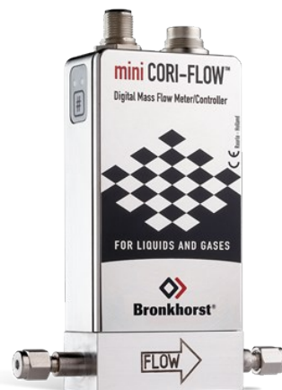
MINI CORI-FLOW™ M12

Min. Bereich 0,4...20 l/min Max. Bereich 0,6...100 l/min Druckstufe 64 bar Kompakte Bauweise Hohe Genauigkeit & Wiederholgenauigkeit