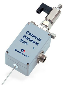
CEM EVAPORATOR W-202A

Max. 120 g/h Flüssigkeit; Max. 10 l/min Gas Druckstufe 100 bar Sehr stabiler Dampf- Durchfluss Flexibles Gas- /Flüssigkeits Verhältnis