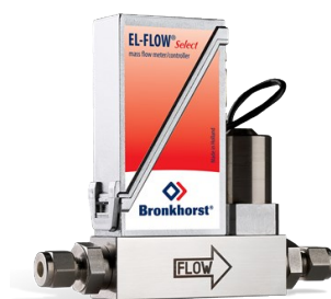
EL-FLOW SELECT F-201CV

Max. 120 g/h Flüssigkeit; Max. 10 l/min Gas Druckstufe 100 bar Sehr stabiler Dampf- Durchfluss Flexibles Gas- /Flüssigkeits Verhältnis