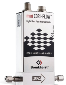
MINI CORI-FLOW™ M12

Min. Bereich 0,25 ... 5 g/h Max. Bereich 5 ... 100 g/h Druckstufe 100 bar kompaktes, IP40 Design Analoge, RS232 oder Feldbus I/O