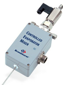
CEM EVAPORATOR W-202A

Min. Bereich 0,16...8 mln/min Max. Bereich 0,5...25 l/min Druckstufe 64 bar Kompakte Bauweise Hohe Genauigkeit & Wiederholgenauigkeit