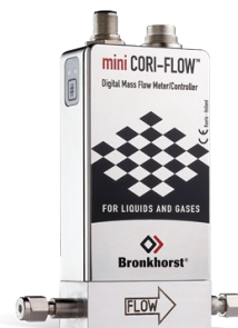
MINI CORI-FLOW™ M12

Min. Bereich 0,25 ... 5 g/h Max. Bereich 5 ... 100 g/h Druckstufe 100 bar kompaktes, IP40 Design Analoge, RS232 oder Feldbus I/O