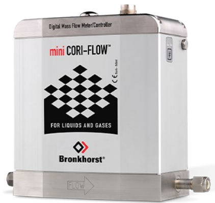
MINI CORI-FLOW™ M15

Min. Bereich 0,03...1 kg/h Max. Bereich 0,3...30 kg/h Druckstufe 100 bar Medienunabhängig Hohe Genauigkeit, schnelle Messung