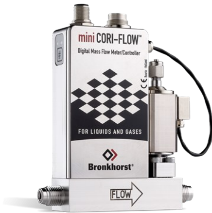
MINI CORI-FLOW™ M14V14I

Min. Bereich 0,03...1 kg/h Max. Bereich 0,3...30 kg/h Druckstufe 100 bar Medienunabhängig Hohe Genauigkeit, schnelle Messung