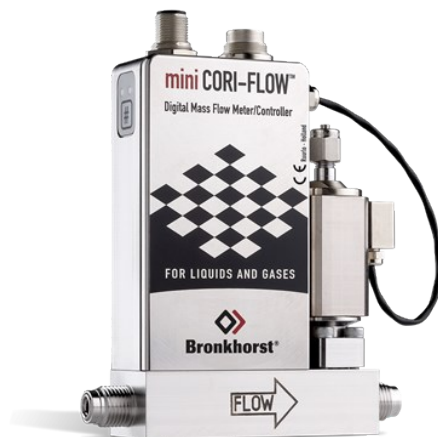
MINI CORI-FLOW™ M14V14I

Kompakte Größe sorgt für gute Raumeffizienz Kostengünstige Lösung, geringe Betriebskosten Kombination von Funktionen auf einem Verteilerblock