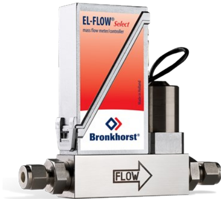
EL-FLOW SELECT F-201CV

Min. Bereich 0,16...8 mln/min Max. Bereich 0,5...25 l/min Druckstufe 64 bar Kompakte Bauweise Hohe Genauigkeit & Wiederholgenauigkeit