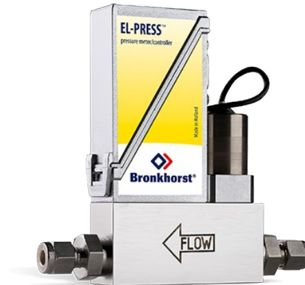
EL-PRESS P-602CV (P2-CONTROL)

Min. Bereich 0,16...8 mln/min Max. Bereich 0,5...25 l/min Druckstufe 64 bar Kompakte Bauweise Hohe Genauigkeit & Wiederholgenauigkeit