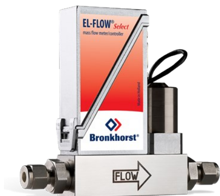
EL-FLOW SELECT F-201CV

Min. Bereich 0,16...8 ml/min Max. Bereich 0,5...25 l/min Druckstufe 64 bar Kompakte Bauweise Hohe Genauigkeit & Wiederholgenauigkeit