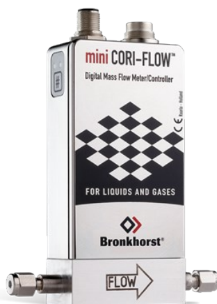
MINI CORI-FLOW™ M12

Min. Bereich 0,16...8 ml/min Max. Bereich 0,5...25 l/min Druckstufe 64 bar Kompakte Bauweise Hohe Genauigkeit & Wiederholgenauigkeit