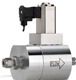
SERIES F-033, F-042

Min. Druck 2...100 mbar Max. Druck 1,28...64 bar Absolut- oder Überdruck Hohe Genauigkeit