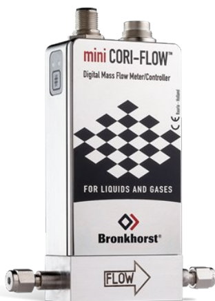
MINI CORI-FLOW™ M12

Min. Bereich 0,1...5 g/h Max. Bereich 2...200 g/h Druckstufe 200 bar Medienunabhängig Hohe Genauigkeit, schnelle Messung