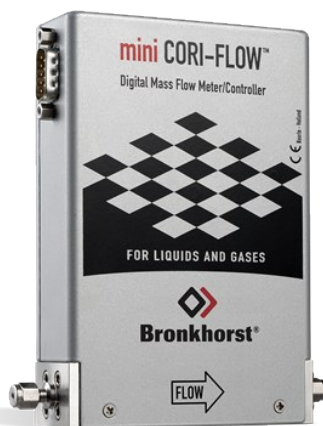
MINI CORI-FLOW™ ML120V00

Min. Bereich 0,1...5 g/h Max. Bereich 2...200 g/h Druckstufe 200 bar Medienunabhängig Hohe Genauigkeit, schnelle Messung