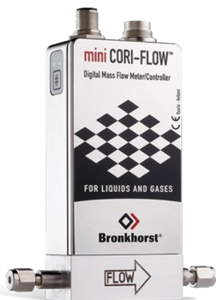
MINI CORI-FLOW™ MXX

Min. Bereich 0,05...5 ml/h Max. Bereich 3...300 l/h Druckstufe bis zu 200 bar Hohe Genauigkeit, schnelle Messung Dichte und Temperaturansicht