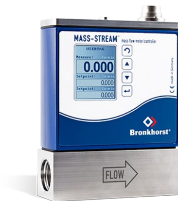
MASS-STREAM D-6360 MFM

Min. Bereich 0,8...40 l/min Max. Bereich 1,4...250 l/min Druckstufe 100 bar Kompaktes IP65 Design Hohe Genauigkeit