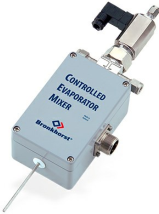
CEM EVAPORATOR W-101A

Max. 2 g/h Flüssigkeit; Max. 4 l/min Gas Druckstufe 100 bar Sehr stabiler Dampf-Durchfluss Flexibles Gas-/Flüssigkeits Verhältnis