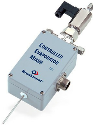
CEM EVAPORATOR W-202A

Max. 2 g/h Flüssigkeit; Max. 4 l/min Gas Druckstufe 100 bar Sehr stabiler Dampf-Durchfluss Flexibles Gas-/Flüssigkeits Verhältnis