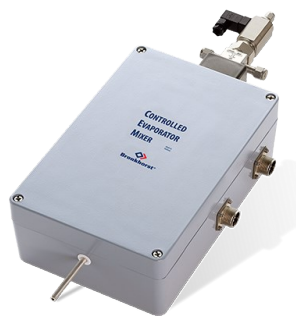
CEM EVAPORATOR W-303B

Max. 120 g/h Flüssigkeit; Max. 10 l/min Gas Druckstufe 100 bar Sehr stabiler Dampf- Durchfluss Flexibles Gas-/Flüssigkeits Verhältnis