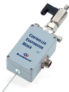
CEM EVAPORATOR W-202A

Max. 2 g/h Flüssigkeit; Max. 4 l/min Gas Druckstufe 100 bar Sehr stabiler Dampf- Durchfluss Flexibles Gas-/Flüssigkeits Verhältnis