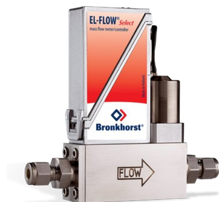
EL-FLOW SELECT F-201AV

Min. Bereich 0,4...20 l/min Max. Bereich 0,6...100 l/min Druckstufe 64 bar Kompakte Bauweise Hohe Genauigkeit & Wiederholgenauigkeit