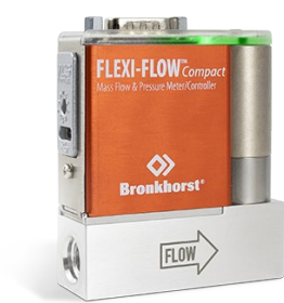
FLEXI-FLOW COMPACT FF-M1X