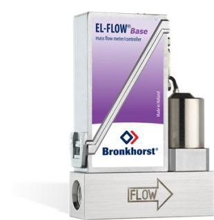
EL-FLOW BASE F-201CB

"The entire 'package' of good purchase price, improved accuracy and flexibility as well as the integrated Modbus protocol has been reason for us to choose for Bronkhorst devices."