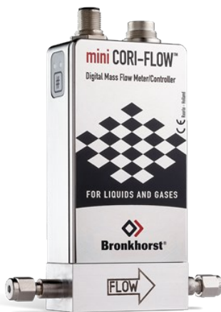
MINI CORI-FLOW™ M14

Min. flow 0,03...1 kg/h Max. flow 0,3...30 kg/h Pressure rating 200 bar Independent of fluid properties High accuracy, fast response