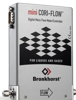
MINI CORI-FLOW™ ML120V00

Min. flow 0,1...5 g/h Max. flow 2...200 g/h Pressure rating 200 bar Independent of fluid properties High accuracy, fast response