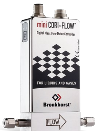
MINI CORI-FLOW™ MXX

Min. flow 0,05...5 ml/h Max. flow 3...300 l/h Pressure rating up to 200 bar High accuracy, fast response Density and temperature output