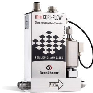
MINI CORI-FLOW™ M13V14I

Flow range 0...200 g/h Pressure rating 100 bar Independent of fluid properties High accuracy, fast control