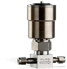
SERIES C2I, C5I

Flow range 0...300 kg/h Pressure rating 100 bar Independent of fluid properties High accuracy, fast response