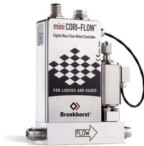
MINI CORI-FLOW™ M12V14I

Flow range 0...200 g/h Pressure rating 100 bar Independent of fluid properties High accuracy, fast control