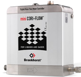
MINI CORI-FLOW™ M15

Flow range 0...2000 g/h Pressure rating 100 bar Independent of fluid properties High accuracy, fast control