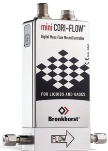
MINI CORI-FLOW™ M12