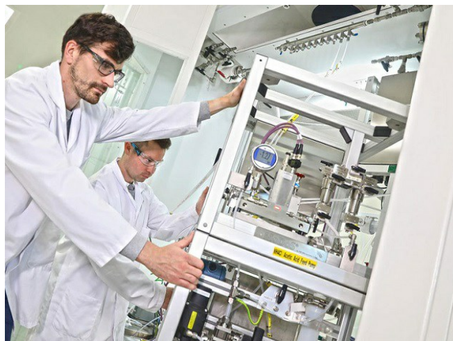
Bronkhorst Liquid Dosing skid

Traditionally, most human pharmaceuticals are manufactured in a step by step batch process to ensure consistent quality and efficacy of the finished medicine. More and more manufacturers switch from the traditional batch manufacturing process to a continuous manufacturing process.