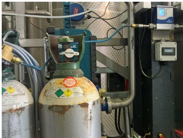
MASS-STREAM mass flow controller is used in a brewery industry