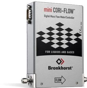
MINI CORI-FLOW™ ML120V21

A traditional way to supply these medicines has been by using a simple syringe or syringe pump. However, a syringe pump lacks exact control over the actual dose of agent. By combing a high-pressure pump with a Coriolis flow meter , you can have this exact control, and therefore, have influence on the actual dose of agent and have a precise dosing solution.