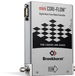
MINI CORI-FLOW™ ML120V00