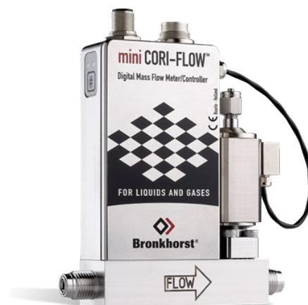
MINI CORI-FLOW™ M14V14I

Min. flow 1...50 g/h Max. flow 20...2000 g/h Pressure rating 100 bar Independent of fluid properties High accuracy, fast control