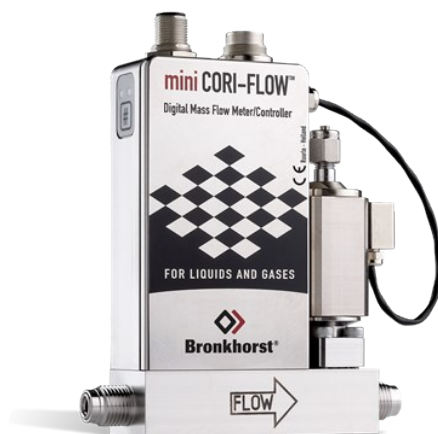
MINI CORI-FLOW™ M13V14I

Min. flow 0,1...5 g/h Max. flow 2...200 g/h Pressure rating 100 bar Independent of fluid properties High accuracy, fast control