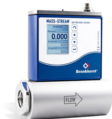
MASS-STREAM D-6370 MFM

Min. flow 2...100 l/min Max. flow 10...1000 l/min Pressure rating up to 20 bar Rugged sensor and housing (IP65) Optional integrated TFT display