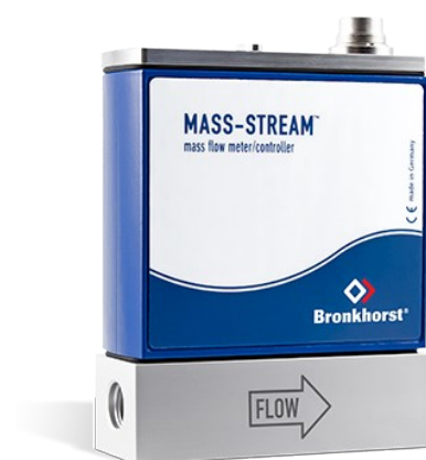
MASS-STREAM D-6341 MFC

Min. flow 2...100 l/min Max. flow 10...1000 l/min Pressure rating up to 20 bar Rugged sensor and housing (IP65) Optional integrated TFT display