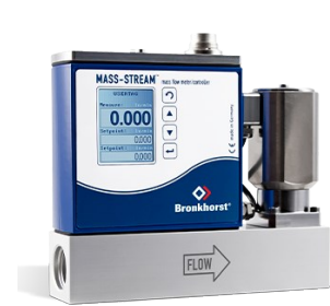
MASS-STREAM D-6361A/002BI MFC