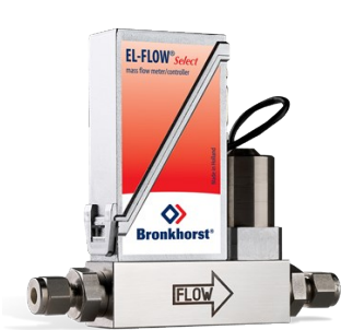
EL-FLOW SELECT F-201CV