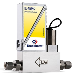
EL-PRESS P-602CV (P2-CONTROL)