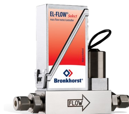
EL-FLOW SELECT F-201CV

Min. pressure 5...100 mbar Max. pressure 3,2...64 bar Absolute or gauge pressure High accuracy