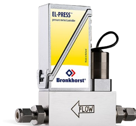
EL-PRESS P-602CV (P2-CONTROL)

Min. flow 0,8...40 l/min Max. flow 5...250 l/min Pressure rating 64 bar Compact IP65 design High accuracy and repeatability