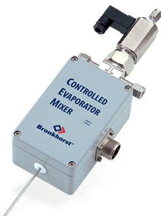
CEM EVAPORATOR W-202A

Max. 2 g/h liquid; Max. 4 l/min gas Pressure rating 100 bar Very stable vapor flow Flexible gas/liquid ratio