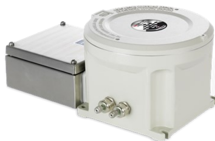
MINI CORI-FLOW EX D XM14

Flow range 0...200 g/h Pressure rating 100 bar Independent of fluid properties High accuracy, fast control