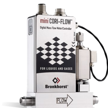
MINI CORI-FLOW™ M12V14I

Flow range 0...200 g/h Pressure rating 100 bar Independent of fluid properties High accuracy, fast control