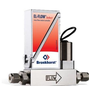
EL-FLOW SELECT F-201CV

Min. flow 0,16...8 mln/min Max. flow 0,5...25 l/min Pressure rating 64 bar Compact design High accuracy and repeatability