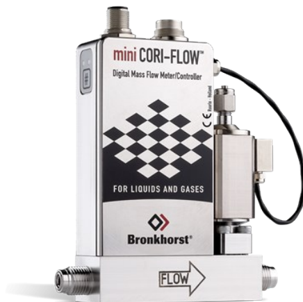
MINI CORI-FLOW™ M14V14I

Compact assembly ensures space efficiency Economical solution, low cost of ownership Combination of functions on one manifold