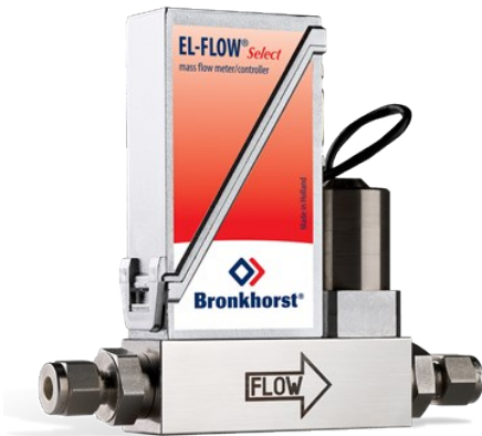
EL-FLOW SELECT F-201CV

Min. flow 0,16...8 ml/min Max. flow 0,5...25 l/min Pressure rating 64 bar Compact design High accuracy and repeatability