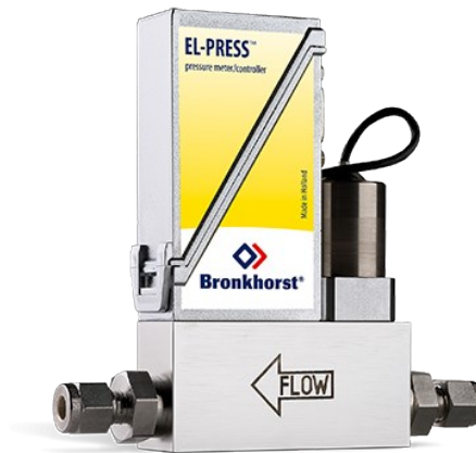
EL-PRESS P-602CV (P2-CONTROL)

Min. flow 0,16...8 ml/min Max. flow 0,5...25 l/min Pressure rating 64 bar Compact design High accuracy and repeatability