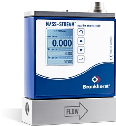
MASS-STREAM D-6310 MFM

Min. flow 0,01...0,2 l/min Max. flow 0,1...2 l/min Pressure rating up to 20 bar Rugged sensor and housing (IP65) Optional integrated TFT display