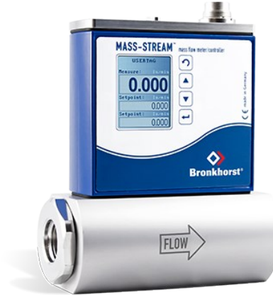
MASS-STREAM D-6370 MFM

Min. flow 0,01...0,2 l/min Max. flow 0,1...2 l/min Pressure rating up to 20 bar Rugged sensor and housing (IP65) Optional integrated TFT display