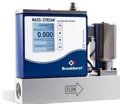
MASS-STREAM D-6361/002BI MFC

Min. flow 40...2000 l/min Max. 100...10000 l/min Pressure rating up to 20 bar Rugged sensor and housing (IP65) Optional integrated TFT display