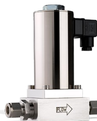
SERIES F-004A, F-004B

Flow up to approx. 500 m 3 n/h Pressure up to 64/100 bar Kv: 0.04...6.0