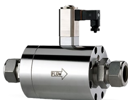
SERIE F-002A, F-003A, F-003B

Flow up to approx. 50 l/min Pressure up to 64/100/200 bar Kv-max: 6.6 \times 10^{-2}