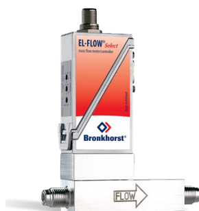
EL-FLOW METAL SEALED F-111CM

Min. flow 0,12...6 mln/min Max. flow 1... 50 lln/min Pressure rating 100 bar Metal-to-metal outer seals Cleanroom assembled