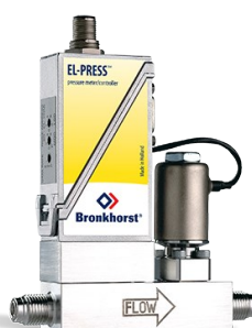
EL-PRESS METAL SEALED P-702CM (P1-CONTROL)

Min. pressure 2...100 mbar Max. pressure 1,28...64 bar Metal-to-metal outer seals Cleanroom assembled