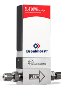
EL-FLOW PRESTIGE FG-110CP (P-INSENSITIVE)

Min. flow 0,14...7 mln/min Max. flow 0,4...20 lln/min Pressure rating 10 bar On-board pressure correction 100 selectable gases