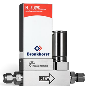
EL-FLOW PRESTIGE FG-201CVP (P-INSENSITIVE)

Min. flow 0,014...0,7 mln/min Max. flow 0,18...9 mln/min Pressure rating 100 bar On-board pressure correction 100 selectable gases