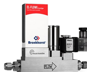
EL-FLOW PRESTIGE FG-201CSP (P-INSENSITIVE)

Min. flow 0,014...0,7 mln/min Max. flow 0,18...9 mln/min Pressure rating 100 bar On-board pressure correction 100 selectable gases