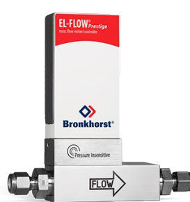
EL-FLOW PRESTIGE FG-111BP (P-INSENSITIVE)

Min. flow 0,14...7 mln/min Max. flow 0,4...20 lln/min Pressure rating 100 bar On-board pressure correction 100 selectable gases