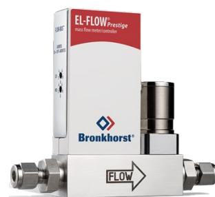
EL-FLOW PRESTIGE FG-210CV

Min. flow 0,14...7 mln/min Max. flow 0,4...20 lln/min Pressure rating 100 bar On-board pressure correction 100 selectable gases