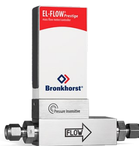
EL-FLOW PRESTIGE FG-111BP (P-INSENSITIVE)

Min. flow 0,14...7 mln/min Max. flow 0,4...20 lln/min Pressure rating 100 bar On-board pressure correction 100 selectable gases