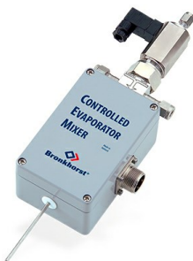
CEM EVAPORATOR W-202A

Max. 30 g/h liquid; Max. 4 l/min gas Pressure rating 100 bar Very stable vapor flow Flexible gas/liquid ratio