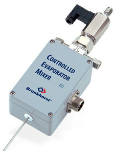
CEM EVAPORATOR W-102A

Max. 30 g/h liquid; Max. 4 l/min gas Pressure rating 100 bar Very stable vapor flow Flexible gas/liquid ratio