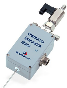
CEM EVAPORATOR W-101A

Max. 2 g/h liquid; Max. 4 l/min gas Pressure rating 100 bar Very stable vapor flow Flexible gas/liquid ratio