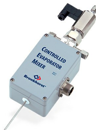
CEM EVAPORATOR W-202A

Max. 30 g/h liquid; Max. 4 l/min gas Pressure rating 100 bar Very stable vapor flow Flexible gas/liquid ratio