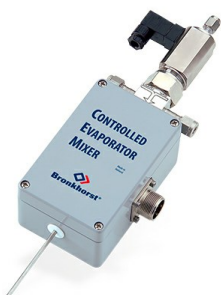
CEM EVAPORATOR W-102A

Max. 2 g/h liquid; Max. 4 l/min gas Pressure rating 100 bar Very stable vapor flow Flexible gas/liquid ratio