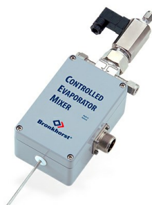
CEM EVAPORATOR W-202A

Max. 30 g/h liquid; Max. 4 l/min gas Pressure rating 100 bar Very stable vapor flow Flexible gas/liquid ratio