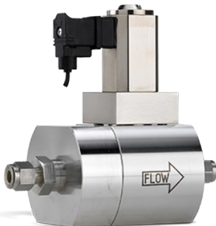
SERIES F-033, F-042

Min. pressure 2...100 mbar Max. pressure 1,28...64 bar Absolute or gauge pressure High accuracy