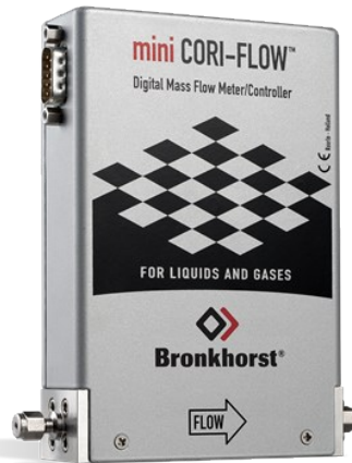
MINI CORI-FLOW™ ML120V00

Min. flow 0,1...5 g/h Max. flow 2...200 g/h Pressure rating 200 bar Independent of fluid properties High accuracy, fast response