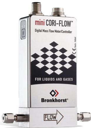
MINI CORI-FLOW™ M12

Min. flow 0,1...5 g/h Max. flow 2...200 g/h Pressure rating 200 bar Independent of fluid properties High accuracy, fast response