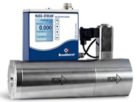
MASS-STREAM D-6371A/003AI & D-6471A/003AI MFC

Min. flow 2...100 l/min Max. flow 20...1000 l/min Pressure rating up to 10 bar Rugged sensor and housing (IP65) Optional integrated TFT display