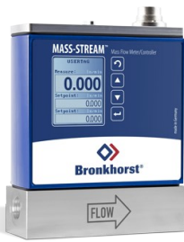
MASS-STREAM D-6341 & D-6441 MFC

Min. flow 0,14...7 l/min Max. flow 1...50 l/min Pressure rating up to 20 bar Rugged sensor and housing (IP65) Optional integrated TFT display