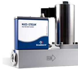
MASS-STREAM D-6371/004BI & D-6471/004BI MFC

Min. flow 0,4...20 l/min Max. flow 4...200 l/min Pressure rating up to 7 bar Rugged sensor and housing (IP65) Optional integrated TFT display