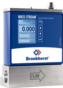
MASS-STREAM D-6361/FAS & D-6461/FAS MFC

Min. flow 0,14...7 l/min Max. flow 1...50 l/min Pressure rating up to 20 bar Rugged sensor and housing (IP65) Optional integrated TFT display