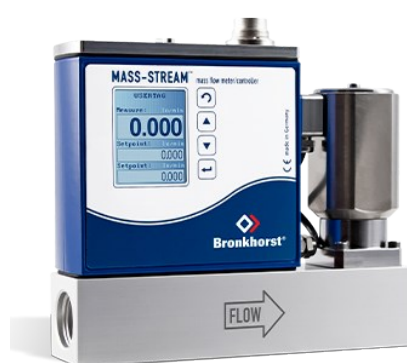
MASS-STREAM D-6361/002BI MFC

Min. flow 0,14...7 l/min Max. flow 1...50 l/min Pressure rating up to 20 bar Rugged sensor and housing (IP65) Optional integrated TFT display