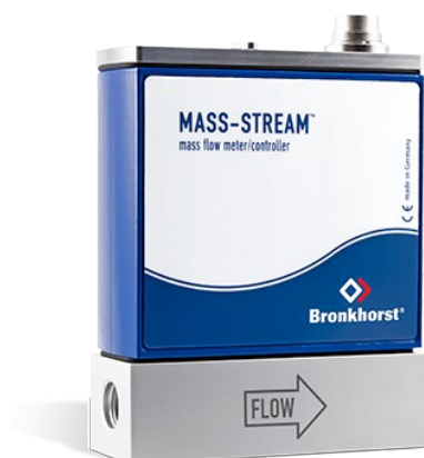
MASS-STREAM D-6341 MFC

Min. flow 0,14...7 l/min Max. flow 1...50 l/min Pressure rating up to 20 bar Rugged sensor and housing (IP65) Optional integrated TFT display