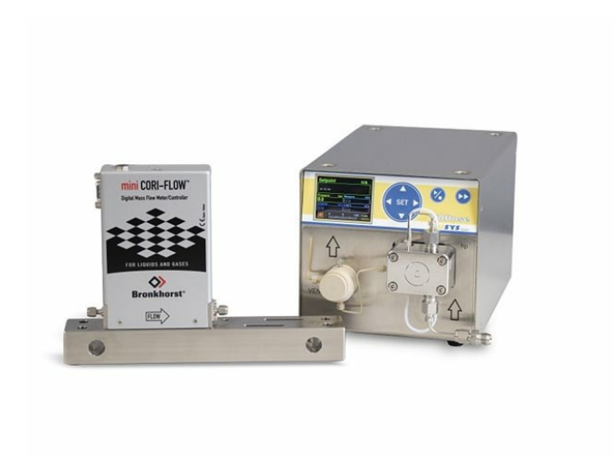
Special version WADose High Pressure Lite pump (with stainless steel pump and PEEK pressure sensor) with Coriolis mass flow meter