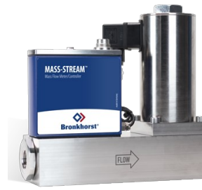
MASS-STREAM D-6371/004BI & D-6471/004BI MFC

Min. flow 6...300 l/min Max. flow 60...3000 l/min For Low-ΔP applications Pressure rating up to 5 bar Optional integrated TFT display