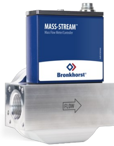
MASS-STREAM D-6471/DR3 MFC

Min. flow 0,14...7 l/min Max. flow 1...50 l/min Pressure rating up to 20 bar Rugged sensor and housing (IP65) Optional integrated TFT display