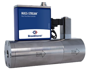
MASS-STREAM D-6371A/003AI & D-6471A/003AI MFC

Min. flow 2...100 l/min Max. flow 20...1000 l/min Pressure rating up to 10 bar Rugged sensor and housing (IP65) Optional integrated TFT display