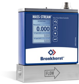
MASS-STREAM D-6341 & D-6441 MFC

Min. flow 0,14...7 l/min Max. flow 1...50 l/min Pressure rating up to 20 bar Rugged sensor and housing (IP65) Optional integrated TFT display